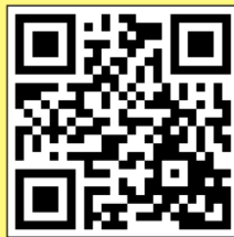
Royalty Rewards® App for Android Phones

There's no need to carry your Royalty Rewards® card when you have the Royalty Rewards® App... it stores your card information for you! Download your FREE App today by scanning the appropriate QR Code!