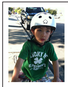
- Hue -