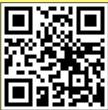
Royalty Rewards® App for iPhone

There's no need to carry your Royalty Rewards® card when you have the Royalty Rewards® App... it stores your card information for you! Download your FREE App today by scanning the appropriate QR Code!